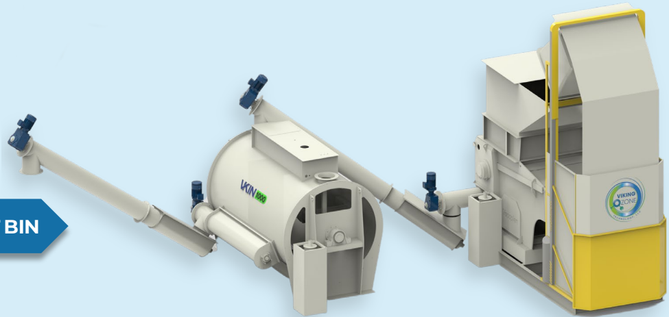
SIDE LIFT BIN