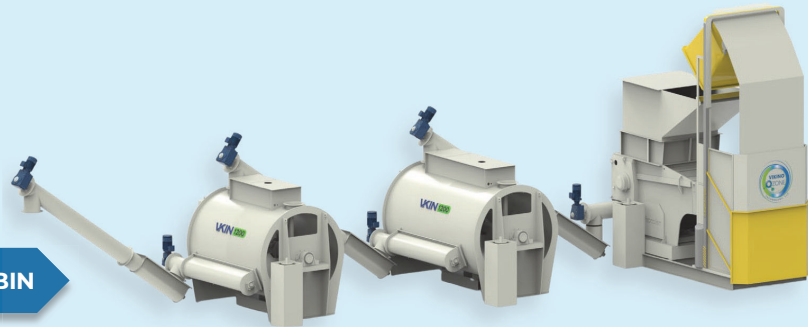
SIDE LIFT BIN